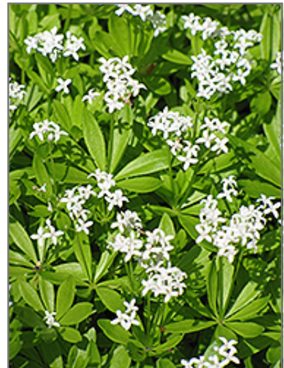
Sweet Woodruff flowers