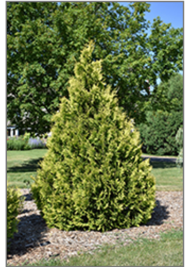
Yellow Ribbon Arborvitae