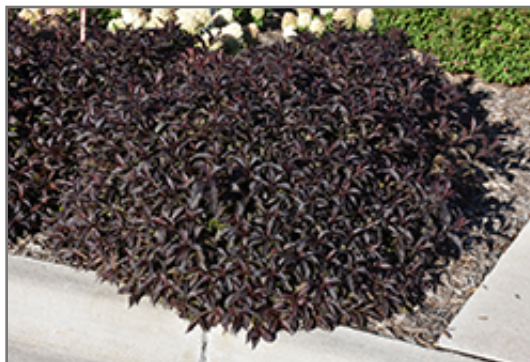
Spilled Wine Weigela