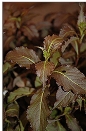
Spilled Wine Weigela foliage

Spilled Wine Weigela makes a fine choice for the outdoor landscape, but it is also well-suited for use in outdoor pots and containers. Because of its height, it is often used as a 'thriller' in the 'spiller-thriller-filler' container combination; plant it near the center of the pot, surrounded by smaller plants and those that spill over the edges. It is even sizeable enough that it can be grown alone in a suitable container. Note that when grown in a container, it may not perform exactly as indicated on the tag - this is to be expected. Also note that when growing plants in outdoor containers and baskets, they may require more frequent waterings than they would in the yard or garden.