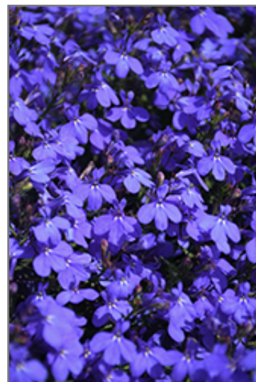
Techno Electric Blue Lobelia flowers

Techno Electric Blue Lobelia is recommended for the following landscape applications;