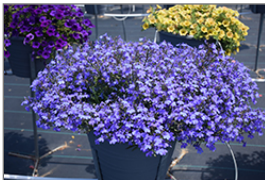
Techno Electric Blue Lobelia in bloom

Techno Electric Blue Lobelia will grow to be about 8 inches tall at maturity, with a spread of 12 inches. When grown in masses or used as a bedding plant, individual plants should be spaced approximately 10 inches apart. Its foliage tends to remain low and dense right to the ground. Although it's not a true annual, this fast-growing plant can be expected to behave as an annual in our climate if left outdoors over the winter, usually needing replacement the following year. As such, gardeners should take into consideration that it will perform differently than it would in its native habitat.