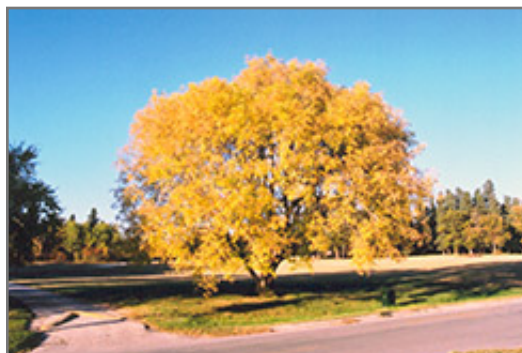
Boxelder in fall