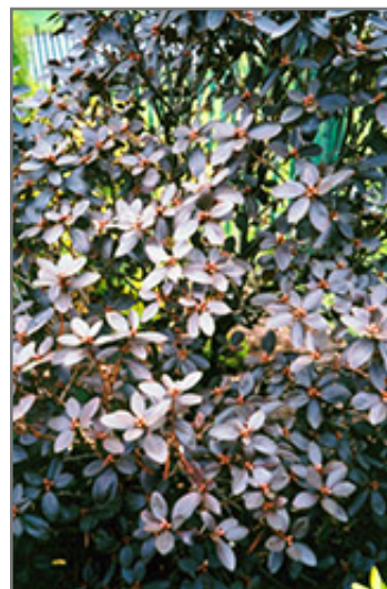
P.J.M. Elite Rhododendron in fall

This shrub does best in full sun to partial shade. You may want to keep it away from hot, dry locations that receive direct afternoon sun or which get reflected sunlight, such as against the south side of a white wall. It requires an evenly moist well-drained soil for optimal growth, but will die in standing water. It is very fussy about its soil conditions and must have rich, acidic soils to ensure success, and is subject to chlorosis (yellowing) of the foliage in alkaline soils. It is somewhat tolerant of urban pollution, and will benefit from being planted in a relatively sheltered location. Consider applying a thick mulch around the root zone in winter to protect it in exposed locations or colder microclimates. This particular variety is an interspecific hybrid.