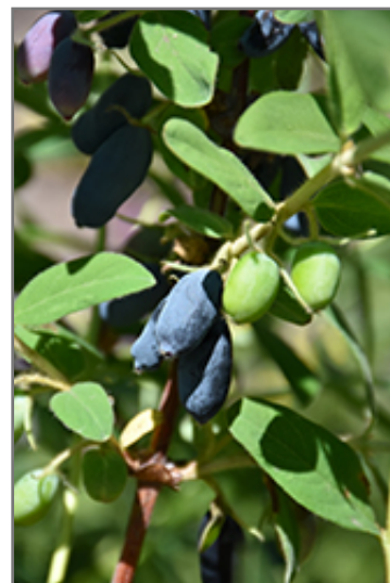
Cinderella Honeyberry fruit

This is a dense multi-stemmed deciduous shrub with a more or less rounded form. Its average texture blends into the landscape, but can be balanced by one or two finer or coarser trees or shrubs for an effective composition. This plant will require occasional maintenance and upkeep, and is best pruned in late winter once the threat of extreme cold has passed. It is a good choice for attracting butterflies to your yard. It has no significant negative characteristics.