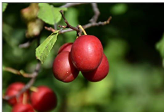
Toka Plum fruit