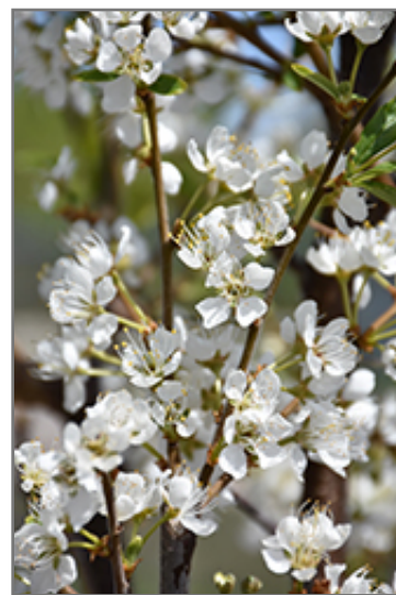
Toka Plum flowers