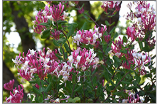
Peaches And Cream Honeysuckle flowers

Peaches And Cream Honeysuckle will grow to be about 20 feet tall at maturity, with a spread of 24 inches. As a climbing vine, it tends to be leggy near the base and should be underplanted with low-growing facer plants. It should be planted near a fence, trellis or other landscape structure where it can be trained to grow upwards on it, or allowed to trail off a retaining wall or slope. It grows at a medium rate, and under ideal conditions can be expected to live for approximately 20 years.