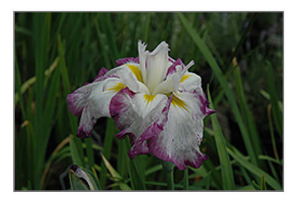
Freckled Geisha Japanese Flag Iris flowers