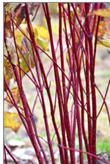
Red Osier Dogwood stems

Red Osier Dogwood is recommended for the following landscape applications;