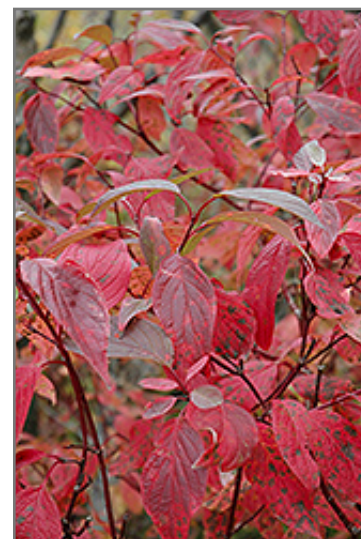
Red Osier Dogwood in fall