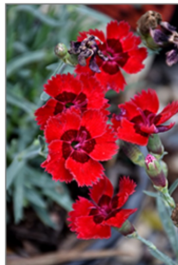
Fire Star Pinks flowers

Fire Star Pinks is recommended for the following landscape applications;